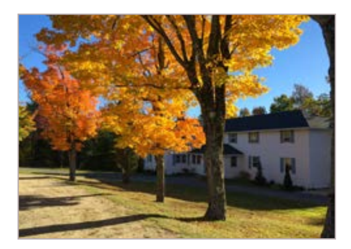
The Lodge building has 11 bedrooms (9 queens, 2 kings) with full kitchen and living areas, along with a separate 2 bedroom (1 king, 1 full) apartment that we call The Nest.

The second home (Hemlock House) has 8 bedrooms (3 kings upstairs with one additional king suite, 4 queens downstairs), is ADA accessible and has large common areas.